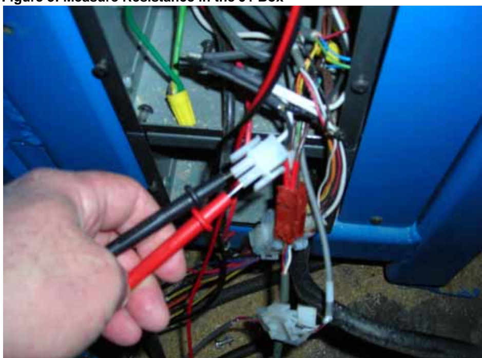
Figure 3: Measure Resistance in the J1 Box