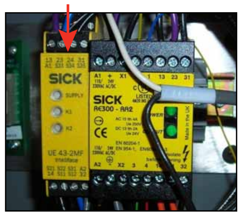
Figure 4: UE 43-2MF SICK Module Scenarios on Miser II Saws