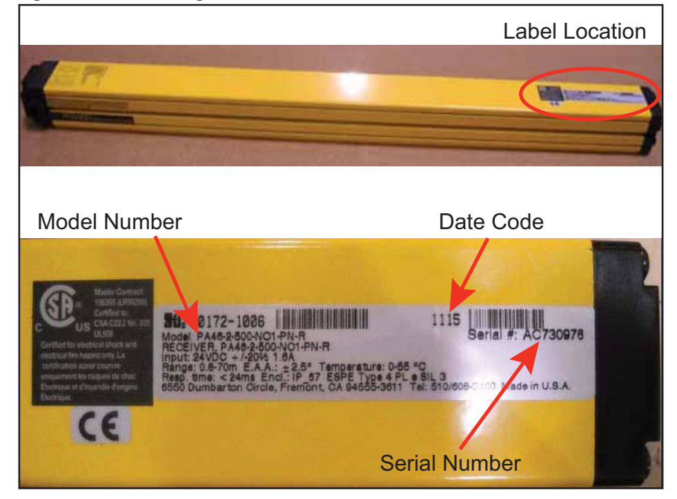
Figure 1: Determining Your Model Number

* The first 2 digits of the Date Code represents the year of manufacture. The last 2 digits of the Date Code represents the week.