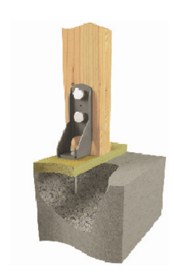
FIGURE 3—TDX HOLD-DOWN SERIES AND TYPICAL INSTALLATION