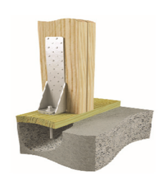
FIGURE 1—HTT16 AND HTT45 TENSION TIE HOLD-DOWN AND TYPICAL INSTALLATION