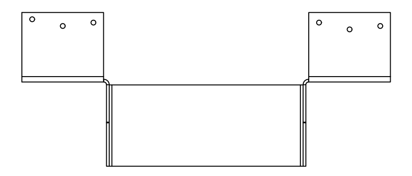
BPHA71118 - TOP VIEW