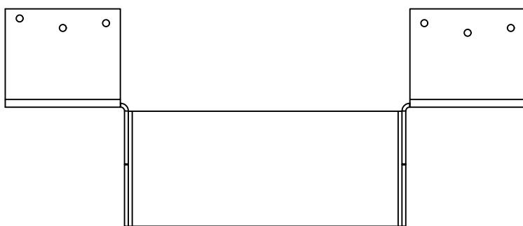
BPHA71112 - TOP VIEW