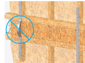
ELIMINATES STRAP BUCKLING

This innovative connection system, comprised of the WSF Screw and PW3 Shrinkage Compensation Device, resists uplift loads between floor levels, while also incorporating a self-ratcheting mechanism that maintains a tight connection when typical wood plate shrinkage occurs.