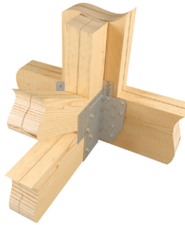
Typical THDHQ28-2 truss installation