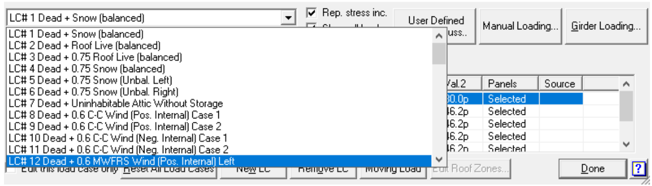
Figure 1 – Load Cases List

Special Loads - [Total LC's - 61] Select Manual or Girder Loading to add special loads to truss