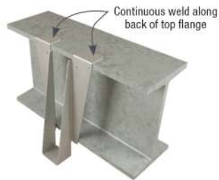
Typical top flange welded installation