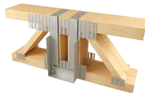
Typical MSH top-min installation

The hanger is installed in a top mount condition with at least the top two header face nail holes filled, and four top flange nail holes filled. Refer to Table 1 below for minimum top flange length requirements. The joist nails shall be installed straight into the joist for all models.