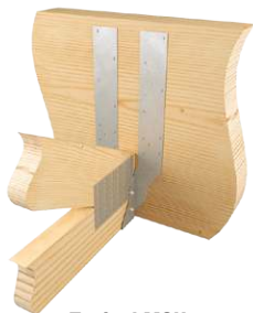
Typical MSH face-max installation

All header nails used should be driven into the wide face of the header.