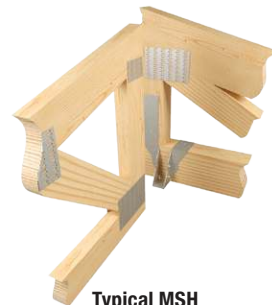
Typical MSH combination installation

Face-Max values apply for the entire connection. Follow fastening directions for the applicable mounting condition for each individual flange strap.