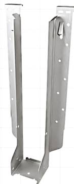
MiTek® USP™ Structural Connectors

Recognized leaders in lateral systems for strength, versatility and performance. Easy to inspect. Easy to install. Fewer callbacks.