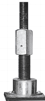
MiTek® Z4™ Tie-Down Systems

Code compliant products backed with robust specifier software, professional engineering and technical support.