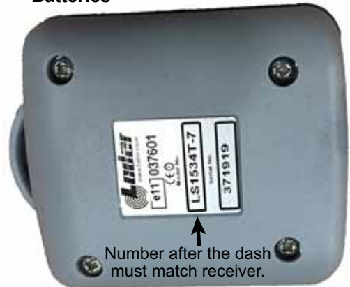
Figure 2: Remove Screws to Access Batteries