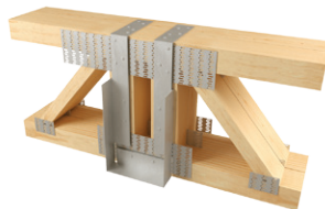
Typical MSH top-min installation

The hanger is installed in a top mount condition with at least the top two header face nail holes filled, and four top flange nail holes filled. Refer to Table 1 below for minimum top flange length requirements. The joist nails shall be installed straight into the joist for all models.