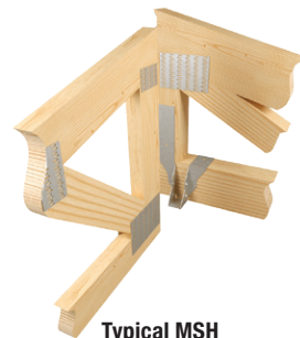
Typical MSH combination installation

Face-Max values apply for the entire connection. Follow fastening directions for the applicable mounting condition for each individual flange strap.