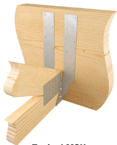
Typical MSH face-max installation

All header nails used should be driven into the wide face of the header.