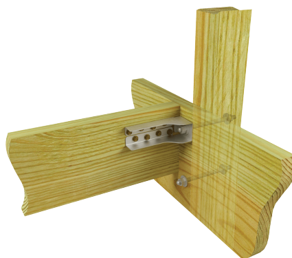
Typical DTB-TZ rail post installation

The building codes specify that the deck to the house attachment must be designed to resist lateral loads. The lateral load connection shall be permitted to be in accordance with Section R507.2.4 of the International Residential Building Code. Holdown tension devices shall be provided in not less than two locations per deck, and each device shall have an allowable stress design capacity of not less than 1500 lbs.