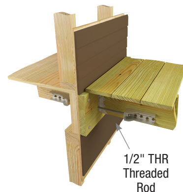
Typical DTB-TZ deck to ledger installation