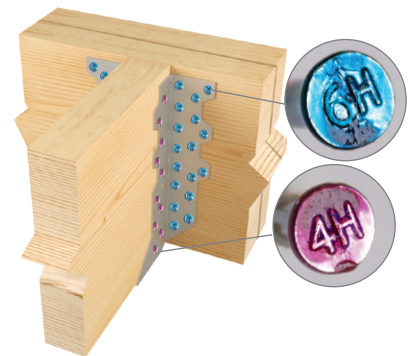
Typical MiTek hanger installation using TECO 33° Collated Nails