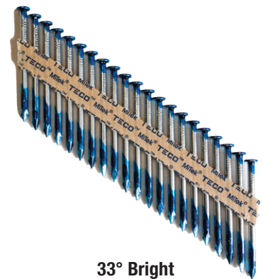
33° Bright Collated Nails