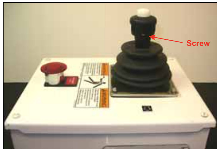
Figure 2: Remove Screw